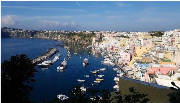
La Corricella, Procida – October 2019

Hoping to confirm all this in the coming months, be well and looking forward to seeing you soon at one or more of these events!