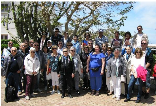
Our last General Assembly in Ischia May 7, 2019