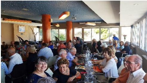
Meeting in Marseille on 28 September 2019

On a beautiful sunny weekend, I had the pleasure of a walk in Marseille on the Old Port, to meet about fifty of you at the UNM restaurant on the occasion of our autumn meetings!