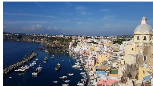
La Corricella, Procida – 14 October 2019