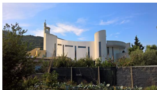
Maria Santissima Madre della Chiesa, Fiaiano

I am pleased to confirm that our next and seventh General Meeting will be held on the island of ISCHIA on Tuesday 11 April 2017, exactly in the Church of "Maria Santissima Madre della Chiesa" in the village of FIAIANO, part of the town of BARANO.