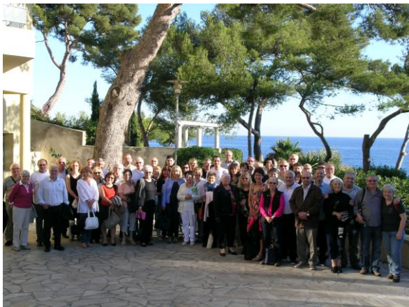
6 th General Meeting on October 10, 2015 in Saint-Mandrier

I was such a nice, sunny and warm day in the beautiful peninsula of Saint-Mandrier, for our 6 th General Meeting!