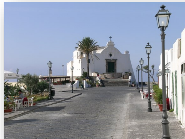
Santa Maria del Soccorso, Forio - 2011