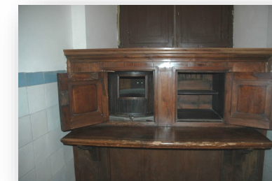
The 'Ruota' of the Annunziata in Naples

A cultural and historic experience in the heart of Naples