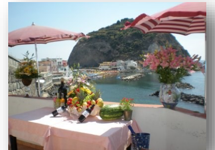
Lunch in Sant'Angelo, Ischia (Neptunus)

Sant'Angelo is an ancient fishing village, situated at the bottom of a semi-crater. The lava island which protects it rises up to the sky and was dedicated to the order of the Archangel Saint Michael (from 1432). In 1507 there were confrontations between the fishermen of Procida who came to fish alongside the rock and to rest in its caves. During the Aragonese period a surveillance tower was built on the rock summit to spot pirate invasions. The tower was bombed and destroyed by the British Royal Navy in 1808.