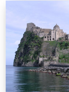
Castello Aragonese, Ischia

Boat tour of the islands of Procida and Ischia