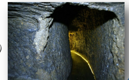
In the antic heart of Naples

The first traces of excavation date as far back as 5000 years ago to the end of the prehistoric era. After this the Greeks mined its quarries for the tuff needed for their fortifications of the town. The Romans then erected an enormous aqueduct and network of tanks on the site which served as anti-air missile shelters during the Second World War.