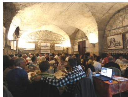
Marseille on October 15

This year, several conferences were scheduled on various and interesting topics such as the confirmations in the 17th century in Procida (French), the advice of an expert on how to lead your research in Ischia (French), the scientific search of parents links in a population (in English), or our new partnership with FamilySearch. You may download these conferences) from the Documentation section of our Web site.