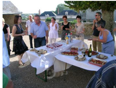
Coulanges/Blois on October 2